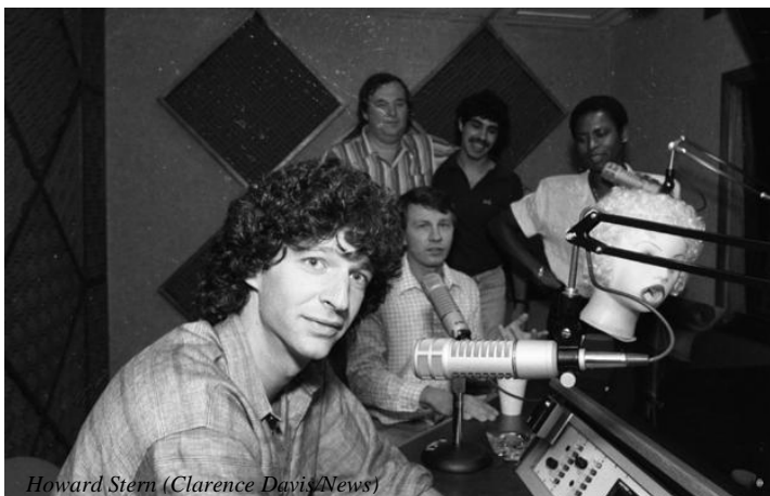
Howard Stern